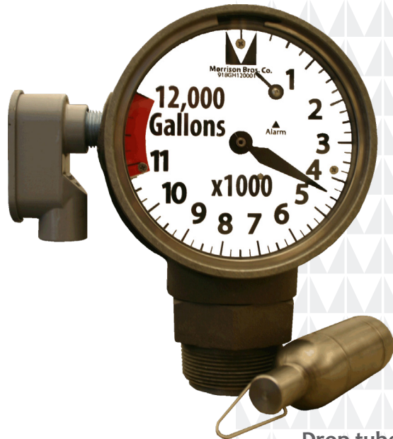
Drop tube float