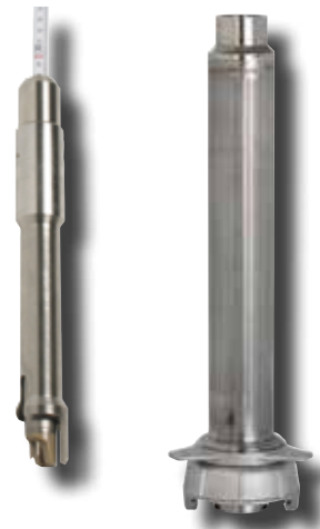
Visc version Storage tube SS2-Q2

Sensor fitted with additional load, recommended for operation in high viscous products.