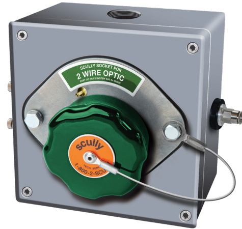
Scully Two-Wire Optic Socket with Polyvinyl Cap

The Scully two-wire optic socket is used to connect up to 8 tanker mounted two-wire optic sensors to a Scully Overfill Prevention Monitor, such as an ST15 single point overfill prevention controller. Can be used on single compartment up to 8 compartment vehicles, with dummy sensors being provided in the socket. It can also have an interlock switch installed which allows the brakes to be applied when the Scully plug is connected, and a pressure switch can be fitted to make sure the connection of the vapour hose is completed before a permissive signal is given by the controller. The socket can have any combination of the above installed at the customer's request.