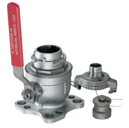
HERMetic quick connector with DUJ multistandard flange, 2" and 1" quick connectors. Ref TS 10083