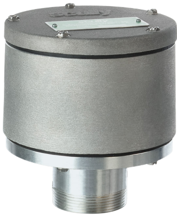
SP-H Holder (for 1-3 sensors)