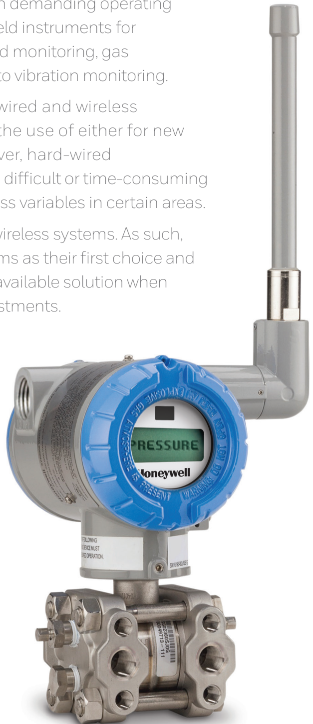
Honeywell SmartLine Wireless Pressure Transmitter