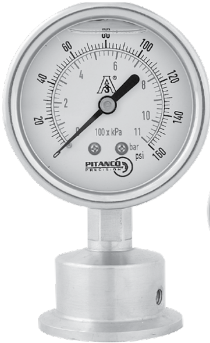
Illustrated model: SDTC20025